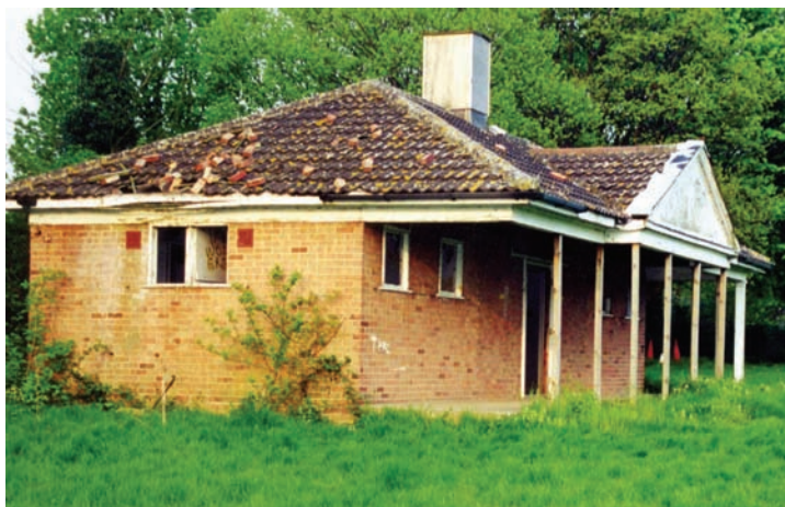
Desolation - the cricket pavilion after the closure of BHCHS p12