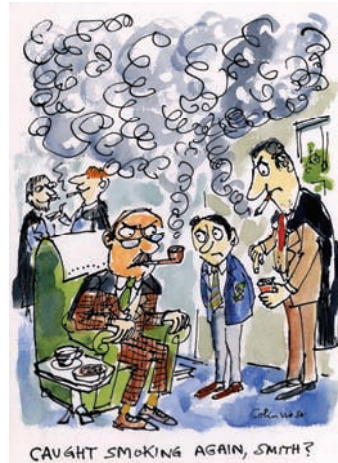
A Colin West masterpiece p 2