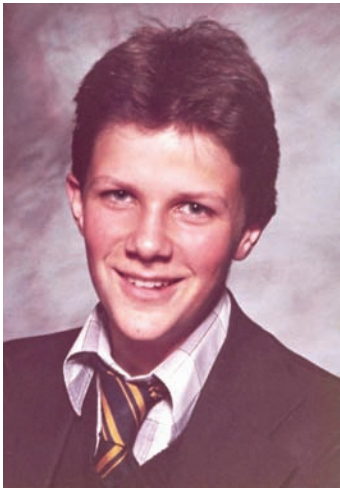
Comedian turned writer p15